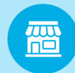
Fundamentals of Retail Management