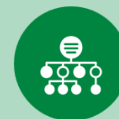
Producer Organization Essentials